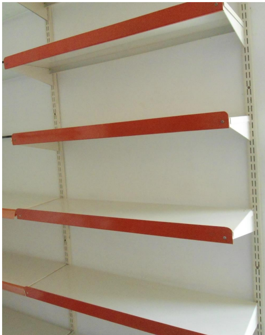
Adjustable Steel Rack (For Design Reference only) (Demand item No. 02)