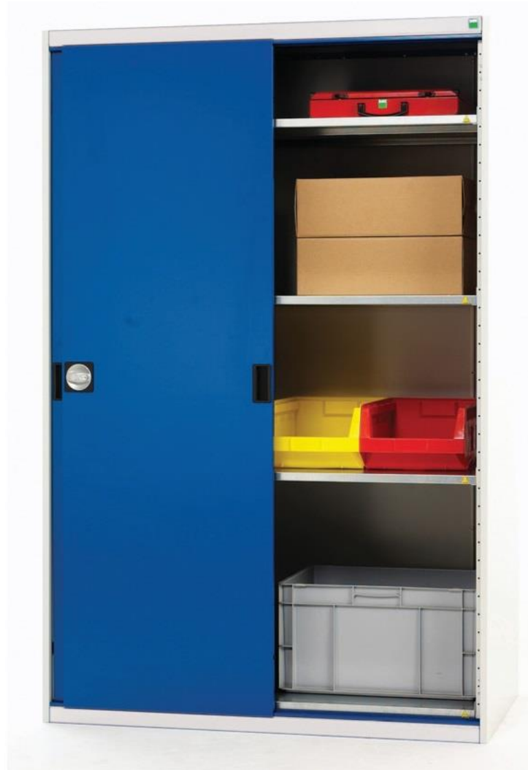
Cupboard for Tools at Lab Store (For Design Reference only) (Demand No. 05)