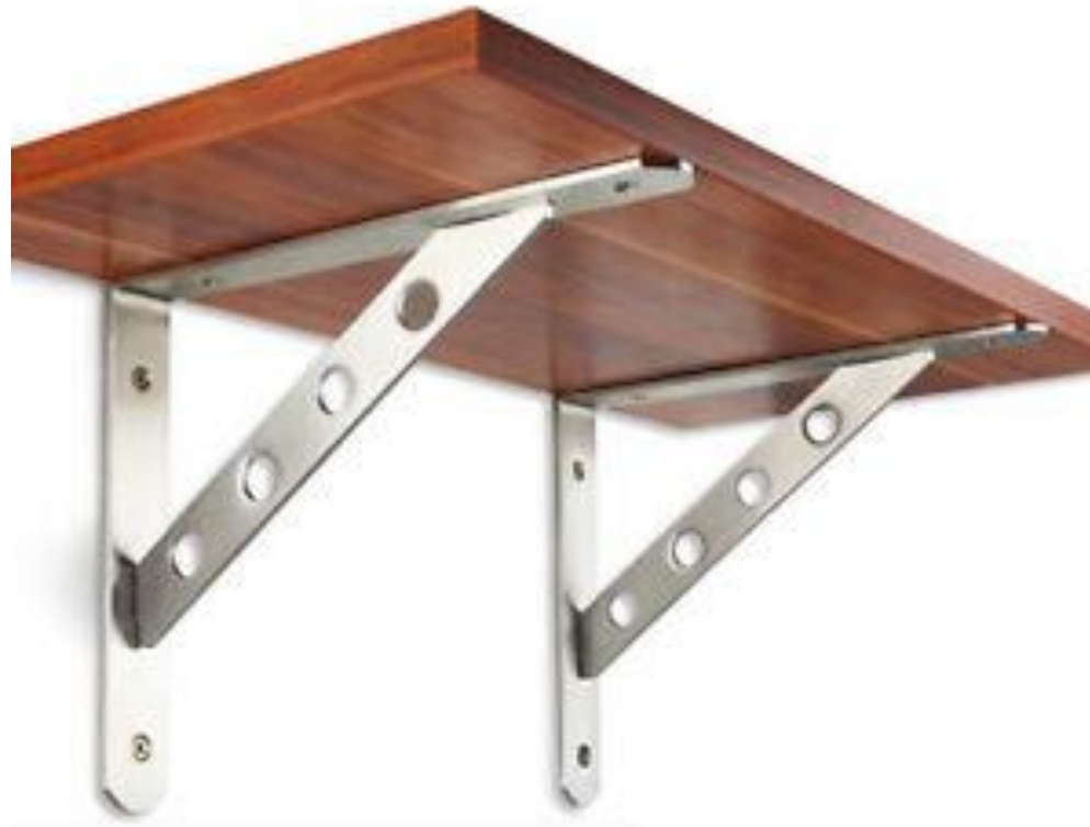
Wooden Rack with wall mounted shelf Bracket L shaped (For Design Reference only) (Demand No. 07)