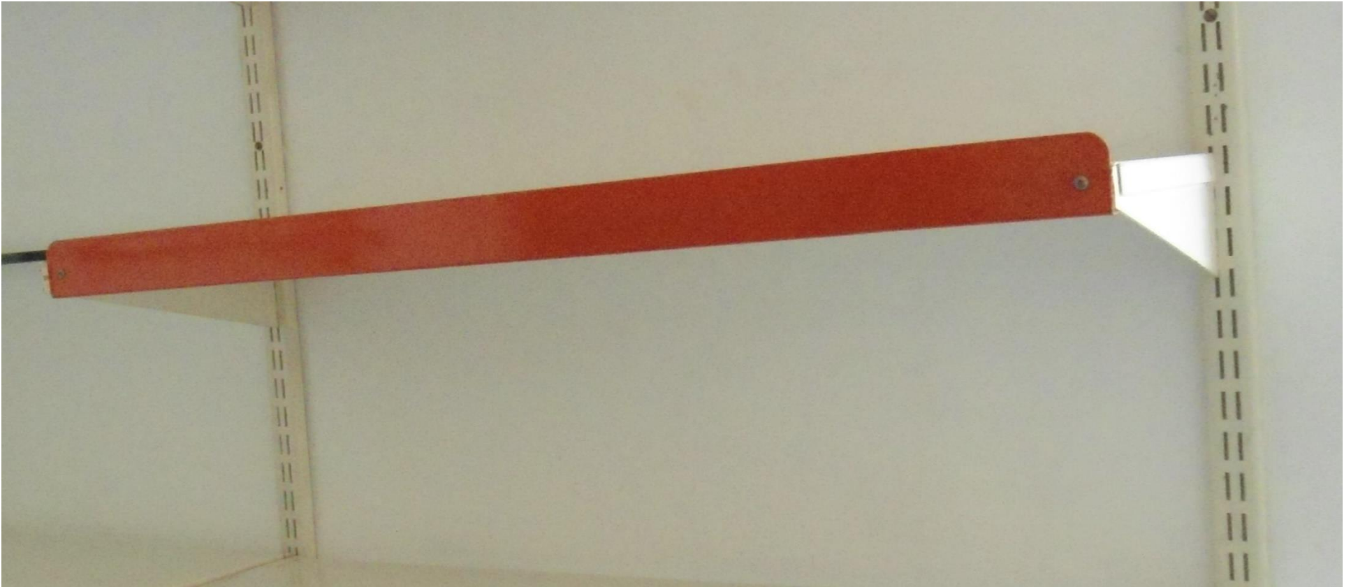
SS Rack with Single channel (For Design Reference only) (Demand item No. 03)