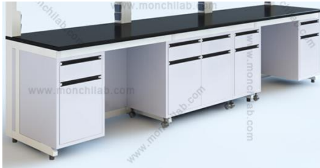
Workstation table with marble top (For Design Reference only) (Demand No.9)