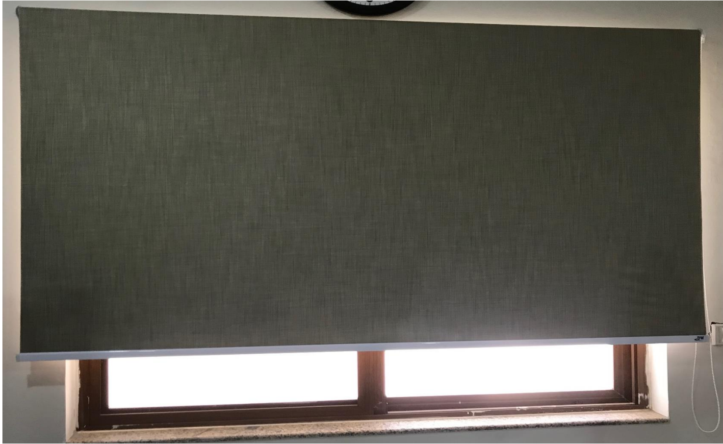
Roller Blind (For Design Reference only) (Demand item No. 04)