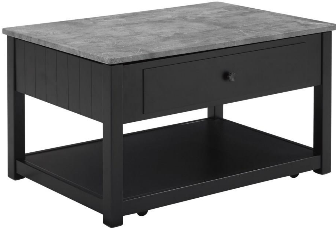
Workstation table with marble top (For Design Reference only) (Demand No.8)